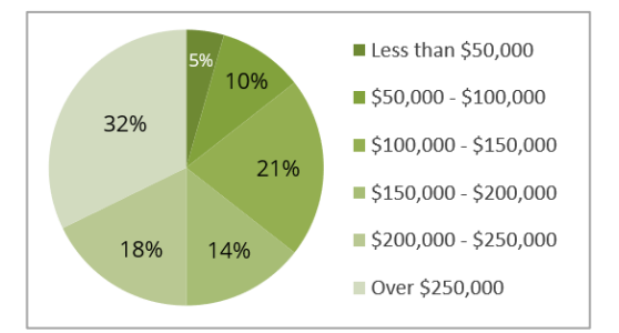
Figure 1. Average annual income for Canadian pipeline construction inspectors.

Based on a 2019 survey<sup>1</sup>, construction inspectors typically earn $75–100 per hour. This relatively high rate, combined with a potentially heavy workload, often provides inspectors with a high annual income (Figure 1). One third of inspectors earn over $250,000 annually, and 85% of survey respondents earn more than $100,000 each year.