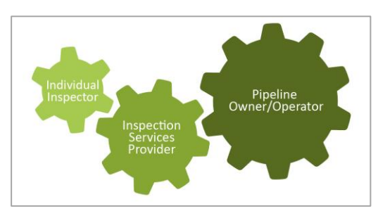
Figure 2. The key players in the Canadian pipeline construction inspector hiring model.

In Canada, when a pipeline operator/owner needs a pipeline construction inspector, it contacts an inspection services provider (Figure 2), who has a list of screened inspectors. The provider looks through its inventory for inspectors who have the credentials, experience, and availability the pipeline owner/operator needs.